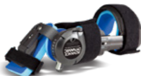
Advance Dynamic Wrist Flexion Orthosis