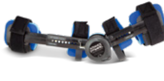
Advance Dynamic Elbow Flexion Orthosis