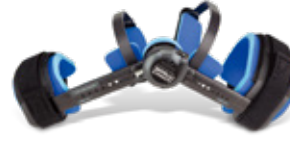
Advance Dynamic Knee Flexion Orthosis