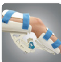
JAS GL Knee-Ext