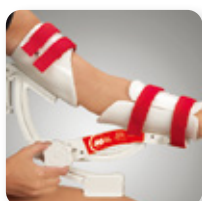
JAS GL Elbow