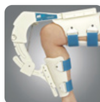
JAS GL Knee-Flex