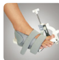
JAS GL Toe