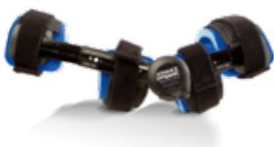
Advance Dynamic Elbow Extension Orthosis