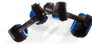
Advance Dynamic Knee Extension Orthosis