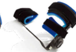
Advance Dynamic Pronation/Supination Orthosis