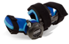
Advance Dynamic Wrist Extension Orthosis