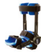
Advance Dynamic Ankle Orthosis