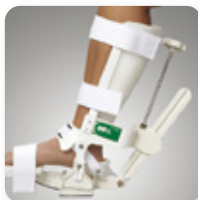
JAS GL Ankle