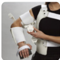
JAS GL Shoulder