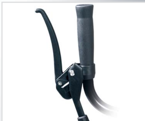
Brake handle left side