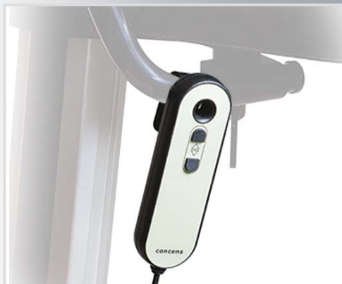
Height adjustment panel (Concens)