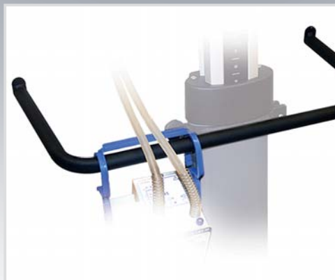
Stand for body fluid-boxes