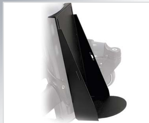
Oxygen bottle holder