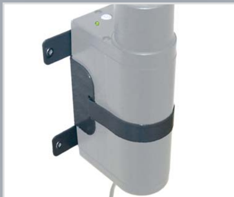
Wall mount for the Taurus battery charger (Concens)