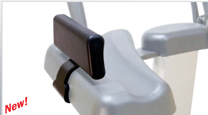
Forearm side support (pair) (Launch winter 2014/15)