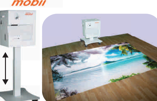
Portable and electrically height adjustable system projecting onto a table, bed or floor.