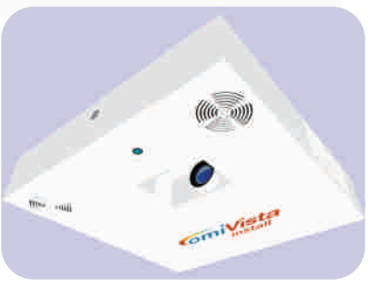
Fixed ceiling system projecting onto a floor or table.