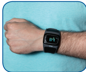
HEART RATE MONITORING