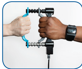
GRIP RAPID EXCHANGE