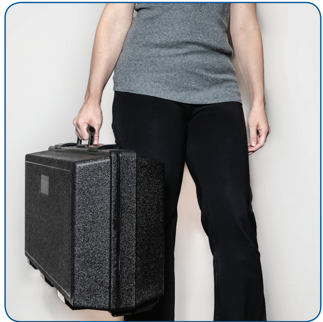
PORTABLE, MODULAR SYSTEM

Modern problems require modern solutions. That's why BTE designed the EVJ – a fully portable and modular testing platform. Tight hardware and software integration saves you time and ensures that your data is precise from one site to the next. EVJ lets you to build the ideal testing system based on your specific needs. This makes entering the world of high precision evaluation and data collection more approachable and affordable than ever.