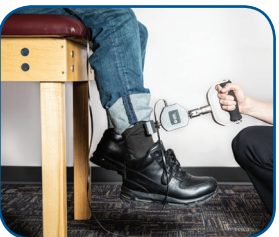
LOWER EXTREMITY STRENGTH