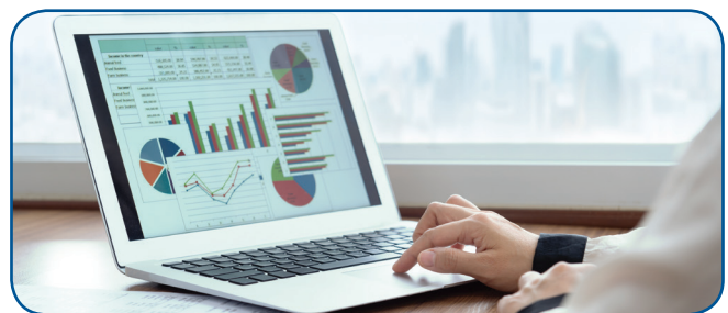
EXPORT ALL DATA FOR ANALYSIS